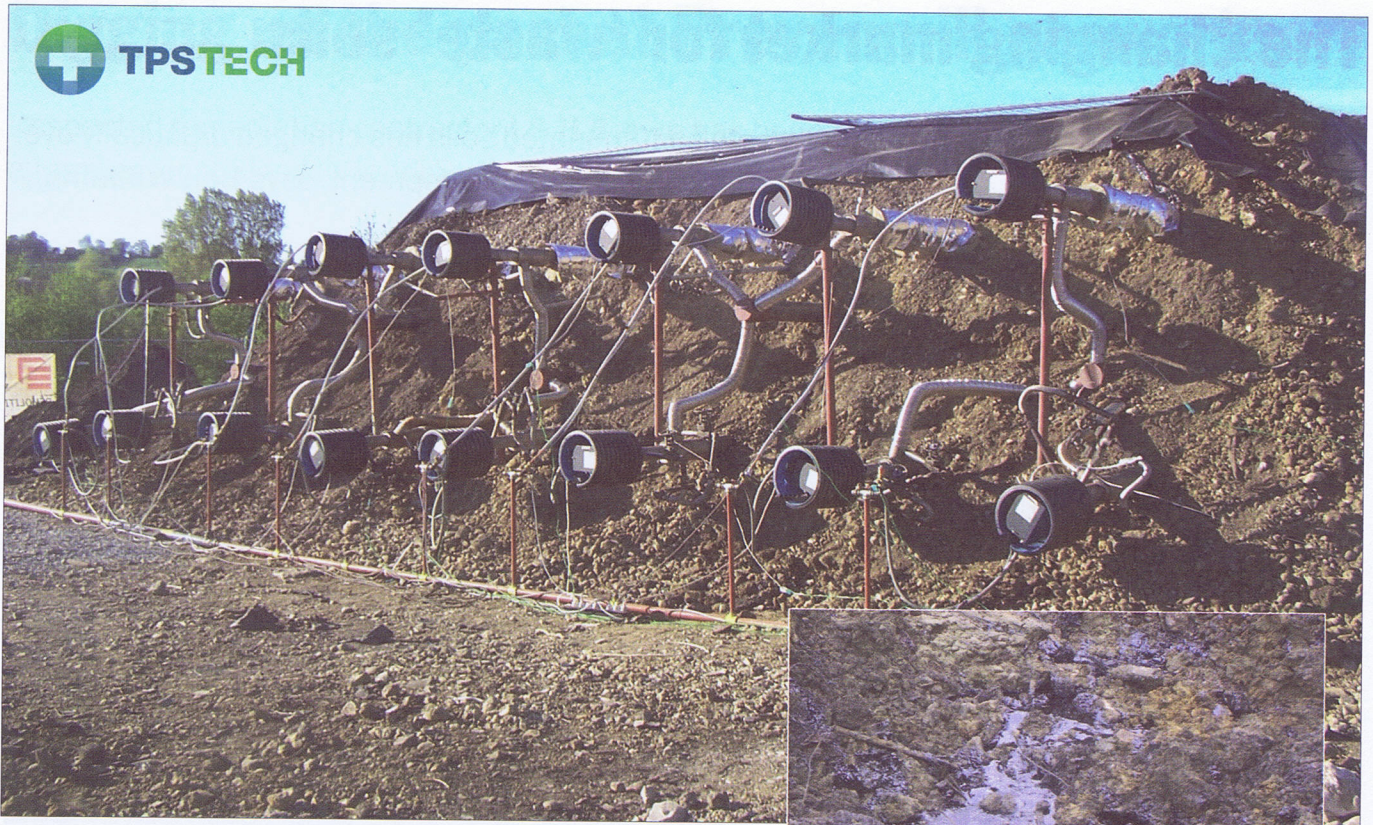
Above: NSR© Industry; Inset: Creosote contaminated soil

vaporise; these vapours are extracted and the contaminants are oxidised at a high temperature.