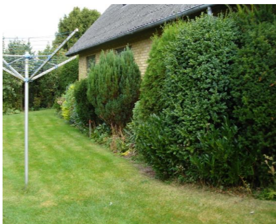
1. Omøvej 1, 4000 Roskilde, Denmark.

The target zone is contaminated with mineral oil. The average concentration in soil is close to 2750 mg/kg with a maximum concentration of 6750 mg/kg, locally. The total mass of the pollutant into the soil is estimated to 5000 kg.