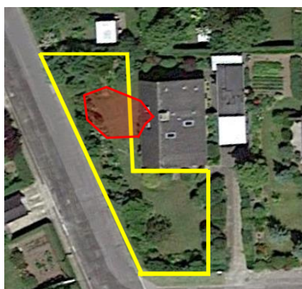
2. Target area to be treated is depicted in red

The project ends as a success (targets completed), temperatures raised very fast and homogeneously. No condensed products are recovered. All the hydrocarbons are directly reinjected into the burners via a re-burn system.