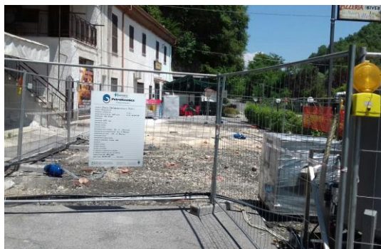
1. Poggio San Lorenzo - Italy.

The site is located near to Poggio San Lorenzo (ITALY), alongside a house and a restaurant. By the past the location has been occupied by a petrol station which spilled diverse contaminants in the ground.