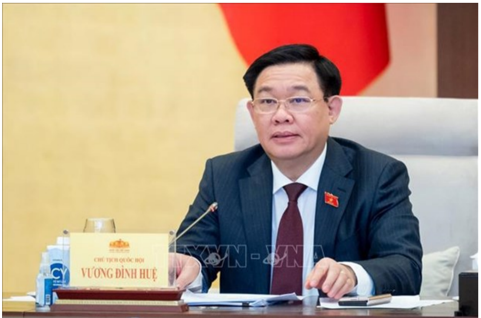
National Assembly Chairman Vuong Dinh Hue.

Hanoi (VNA) – National Assembly (NA) Chairman Vuong Dinh Hue has sent a thank-you letter to President of the Belgian Chamber of Representatives Eliane Tillieux as the chamber on October 5 passed a resolution in support of the Agent Orange (AO)/dioxin victims in Vietnam, with absolute approval votes.